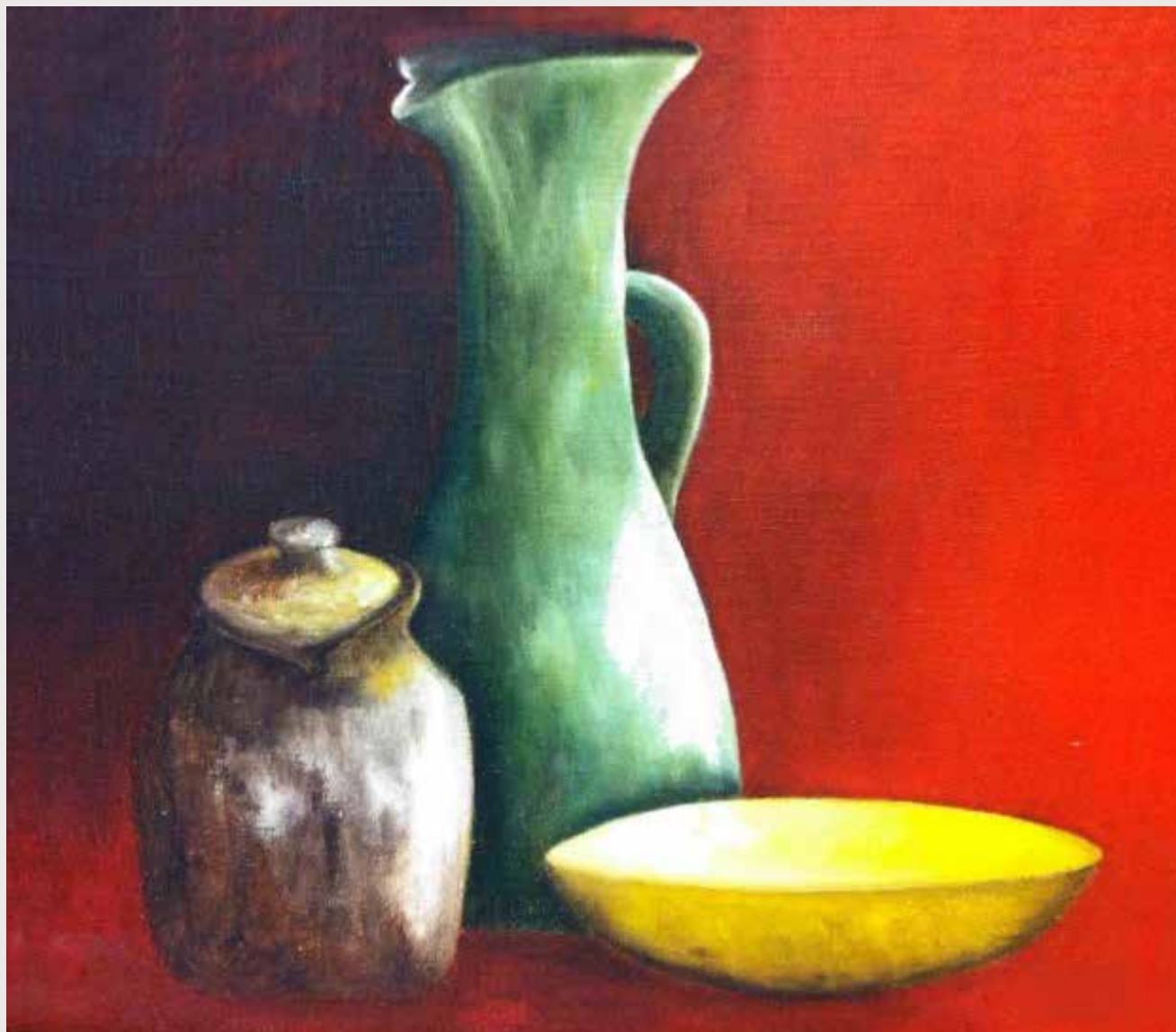
Still life painted by Norma