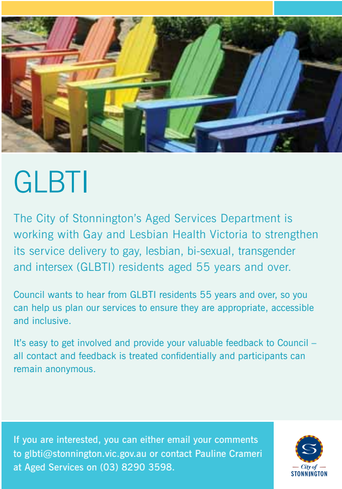
Figure One: flyer for GLBTI consultation

A brief GLBTI survey has been developed for any people contacting us as a result of the flyer. To date four clients and one community member have responded to the invitation. All have agreed to participate in a further communication and/or discussion group.