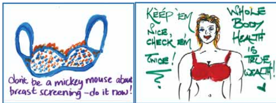
Figure Three and Four: messages to LBT women

In the year after Midsumma Carnival, BSV participated in a Lesbians and Breast Cancer Forum facilitated by Gay and Lesbian Health Victoria (see figure five). The Forum included presentations by a researcher on the rates of breast cancer in lesbians, stories from two lesbians with breast cancer and a presentation on this project by BSV.