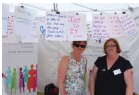
Figure Two: BSV stall at Midsumma Carnival

A common response from LBT women as they walked past and saw the stall was: Ooh! This response was discussed with one participant who reported that the stall reminded her that she needed to have a