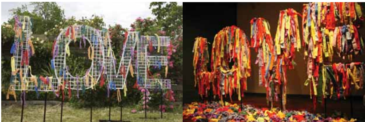
Figure One and Two: love sculpture with messages of support for the GLBTI community

As the sculpture toured local communities and galleries we advertised for expression of interest in a local GLBTI consultative group. We also gave these flyers to staff for themselves, friends, family and clients and advertised in local media. The project coordinator also gave a number of radio interviews on the mental health and wellbeing issues for our GLBTI community. Slowly we started to receive calls from GLBTI people. Each individual had a story to tell and wanted to be active in making change in the community but had real concerns of safety, confidentiality and anonymity. To address this we began the process by meeting with members of the group individually. When the group was ready to meet as a collective we developed group 'rules' that outlined the importance of confidentiality. The rules were discussed at the first meeting, with the project coordinator highlighting that in a small rural town it was particularly important to protect confidentiality. The group were prepared for the likelihood that they would run into each other in the street and how important it was not to acknowledge the GLBTI consultation group in that setting. The group also discussed the importance of protecting the identity of some Trans members who were not known as Trans people in the local community.